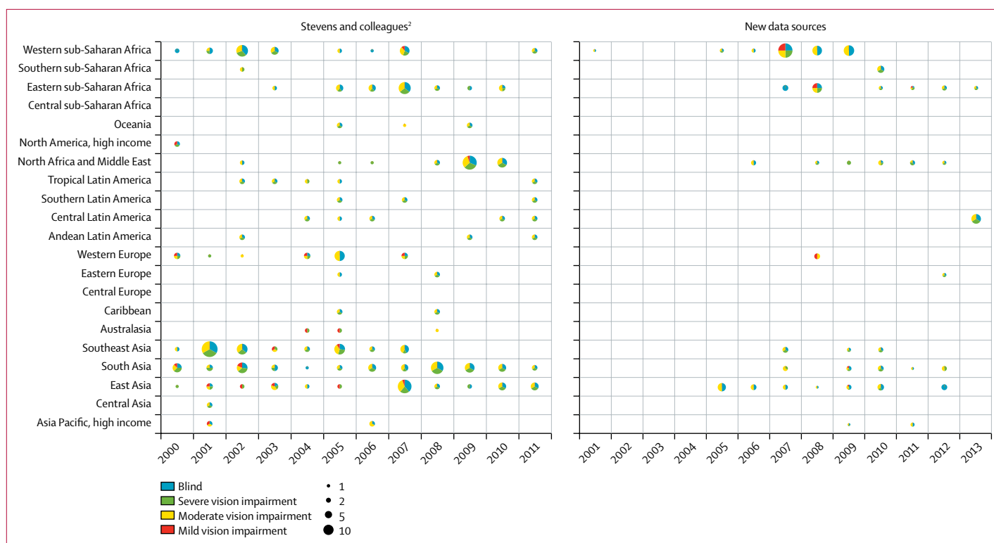
Figure 1: Population-based prevalence studies of blindness and vision impairment in the Global Vision Database Volume of new studies by region and reporting by vision loss severity are presented with a comparison to those in the original systematic review. 8 New studies were obtained from Afghanistan, Bhutan, Burundi, China, Egypt, Eritrea, Ethiopia, Ghana, Honduras, India, Iran, Jordan, Kenya, Laos, Libya, Madagascar, Moldova, Mozambique, Nepal, Nigeria, Norway, Panama, Saudi Arabia, South Africa, South Korea, Taiwan, Tanzania, Timor-Leste, Turkey, Uganda, Vietnam, and Zambia. Black bubbles indicate the number of studies.

the report. The corresponding author had full access to all the data in the study and had final responsibility for the decision to submit for publication.